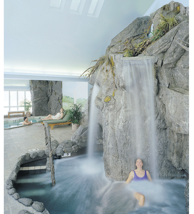
Stoweflake Mountain Resort & Spa is a stylish full-scale getaway with discounts for Canadians. STOWEFLAKE MOUNTAIN RESORT & SPA

Stowe Mountain Resort had the strongest snow start of any northeast area with top-tobottom skiing and riding. If you buy tickets online at least 48 hours in advance you'll save 30 per cent. With Stowe now part of